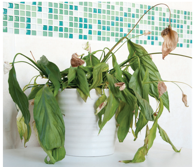
Figure 43. Spathiphyllum showing signs of water stress (e.g. wilted leaves, yellowed older leaves, browning of leaf margins and tips, death of flowers).

Another method of determining need is to monitor the moisture level in the soil with a