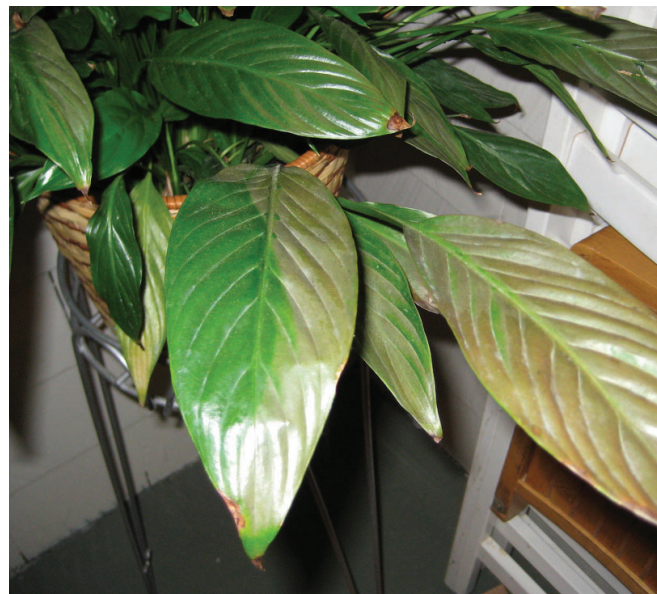
Figure 44. Sun scald on spathiphyllum leaves.

Flowering is initiated in some plants when the nights get longer. Examples of these short-day plants include chrysanthemum and poinsettia. Placing these plants under a light disrupts their perceived day length, and they will not bloom properly. Other plants bloom in the spring with flower initiation triggered